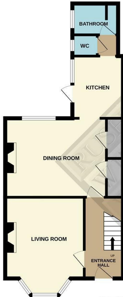
GROUND FLOOR 527 sq.ft. (49.0 sq.m.) approx.